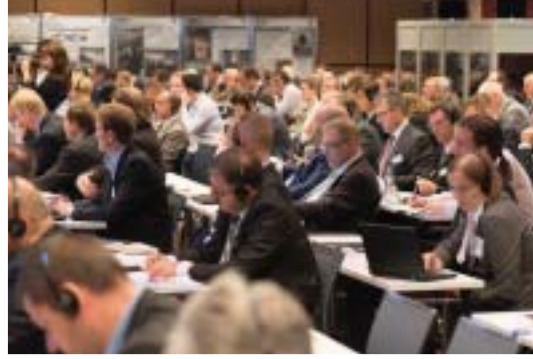
7 th annual international conference VVER 2016, 220 participants